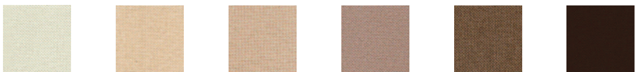
ecru hessian caramel mocha truffle cocoa