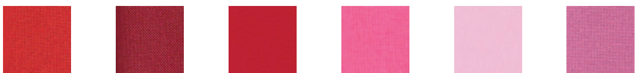
maraschino claret raspberry hot pink blush mulberry