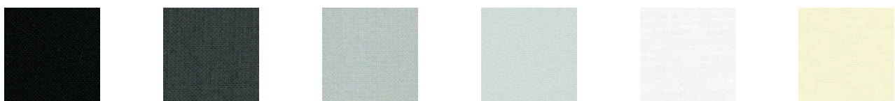
raven pewter flint slate china white ivory