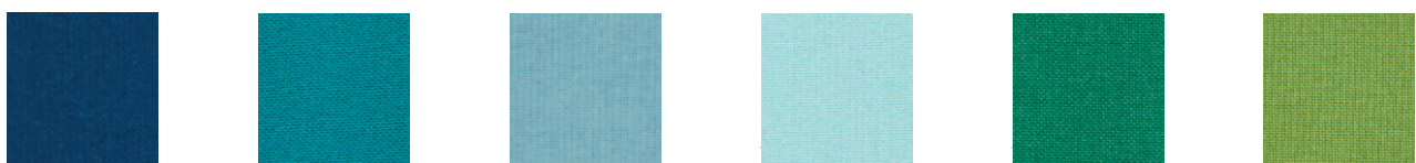
peacock teal duckegg lily laurel moss