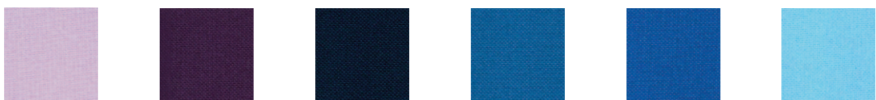
mauve purple navy denim royal sky