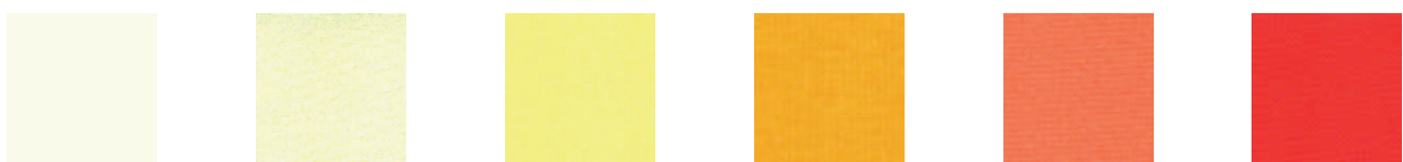
cream vanilla canary sunflower terracotta strawberry